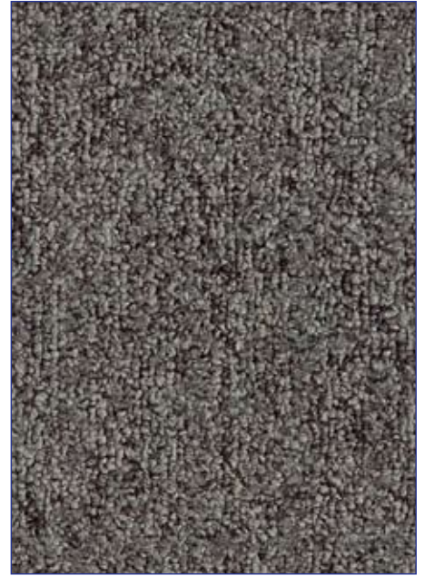
4115 Huntington Ravine 24"