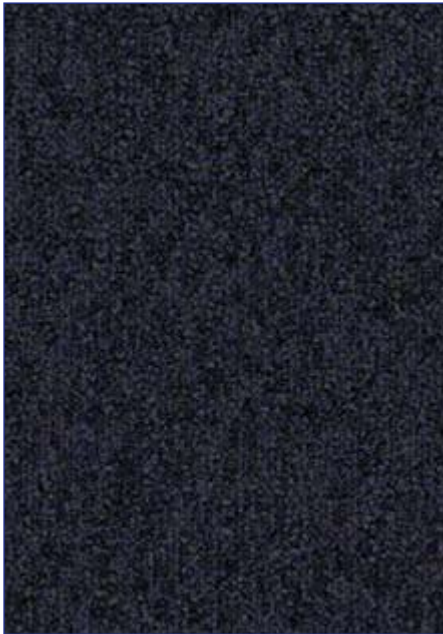
4117 Allaghash 24"