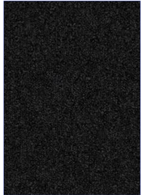
4118 Moloaa Beach Rock 24"