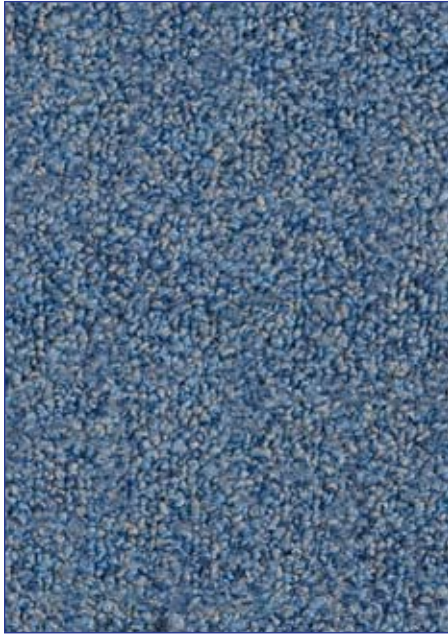
4113 Thunder Bay 24"