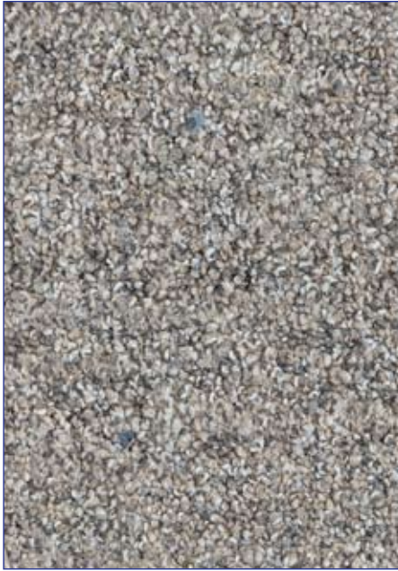
4114 Chesapeake Sandbar 24"